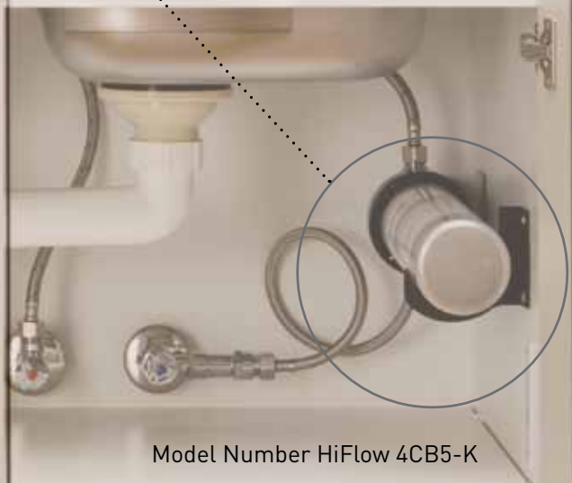
Model Number HiFlow 4CB5-K

Introducing a new innovation in filtered water.