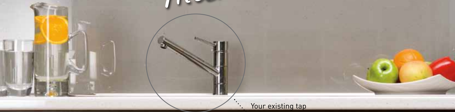
Your existing tap