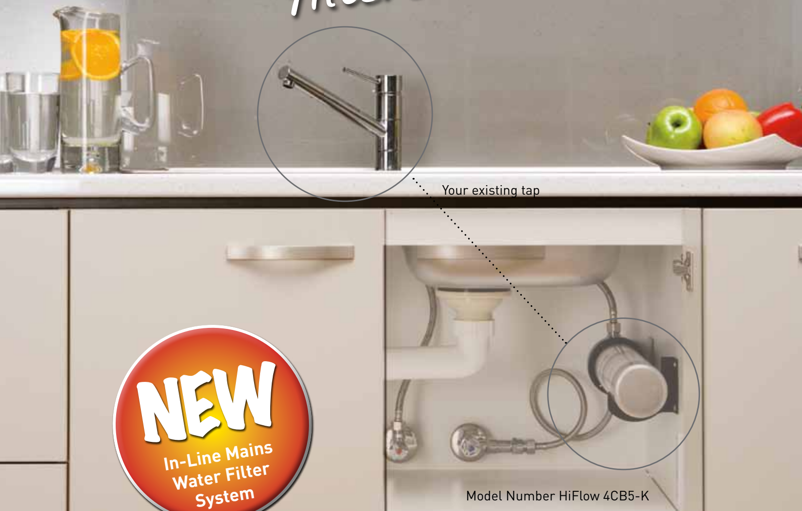
Your existing tap