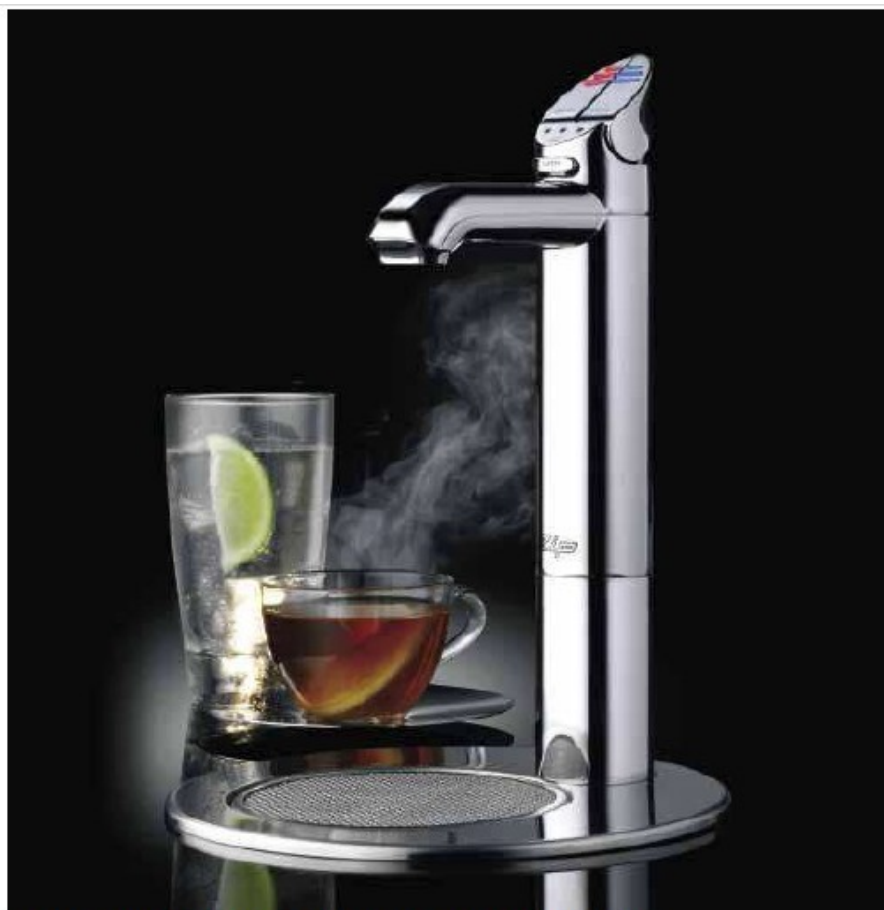
Boiling + Chilled model shown with optional Tap Font and 80mm extension.