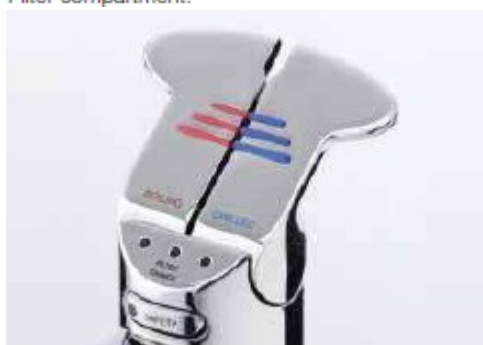
Over-sized levers available for people with restricted mobility.